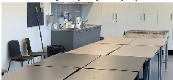
Craft Workshop - Capacity: 8-14 people