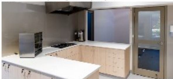
Kitchen - Capacity: 9-12 people