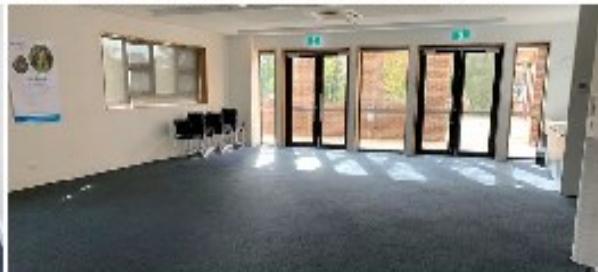
The Garden Room - Capacity: 48 people