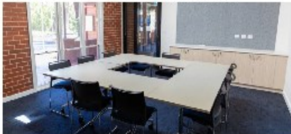
Meeting Room - Capacity: 6-12 people