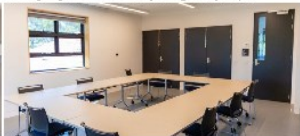
Multipurpose 1 & 2 - Capacity: 28 people